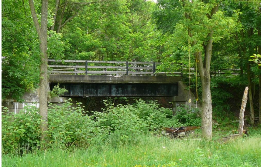
2010 photos Bryan Seip

Looking south from Station Street side – 1928 in concrete deck. No Builder's Plate, but probably a McClintic-Marshall Co. bridge, installed during realignment of main line. Railings and fences installed as bridge converted for Trail use.