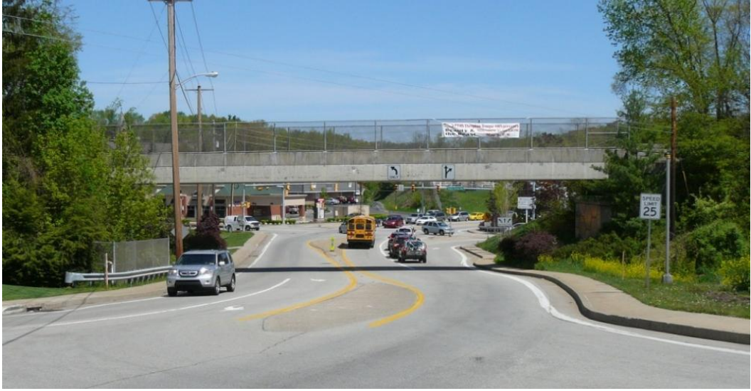
2010 photos Bryan Seip

View looking north from Thomas Road in 2010 with Valley Brook Road intersection in background. New 110 foot bridge spans 4 traffic lanes plus increased sight lines.