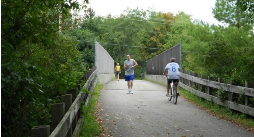
Looking west across bridge from location behind Farmhouse Coffee.