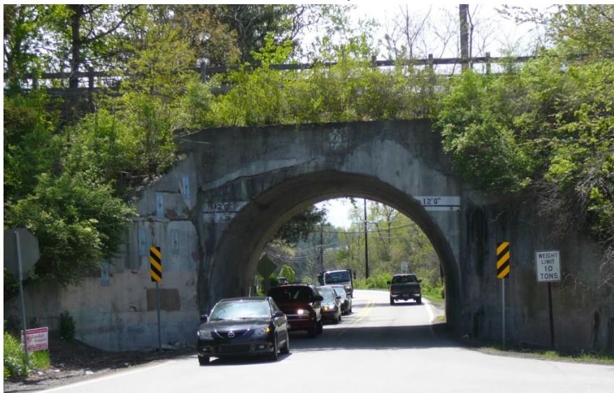
2011 photos Bryan Seip

View looking south from Valley Brook Road intersection. 12' 0" clearance presents problems for large trucks and sight lines from Valley Brook intersection limit view of traffic approaching on Bebout Road. These conditions caused PennDOT to place the arch on their list for removal and replacement.