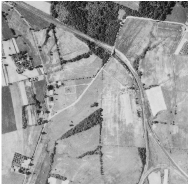
1939 view courtesy Penn Pilot

Aerial views show the bridge site over the railroad and cut. The bridge is above center, with the railroad/trail running from top left to bottom right, where Library Junction's wye can be seen. Brush Run Road runs from center left to upper right. Peters Presbyterian Church is at the intersection of Brush Run and Brookwood Roads in lower left quadrant. Houses now fill farm land on both sides of Brush Run Road.