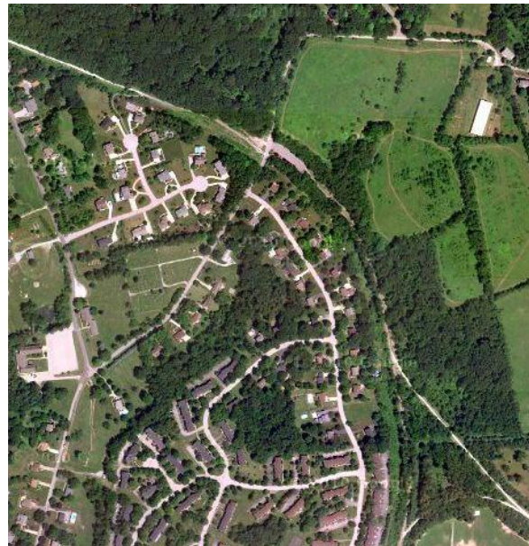
2011 view