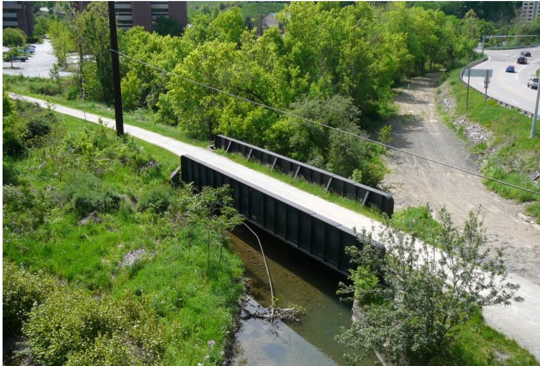
2010 photos Bryan Seip

Originally, this was a Deck Plate Girder bridge. This view is looking south (RR East) towards Briggs & Turivas, October, 1947, before Parkway construction.