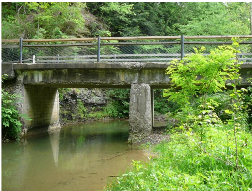
2010