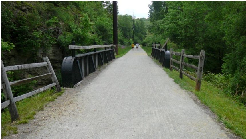
2010 photos Bryan Seip

Looking east (RR West) – Skew construction evident in this view