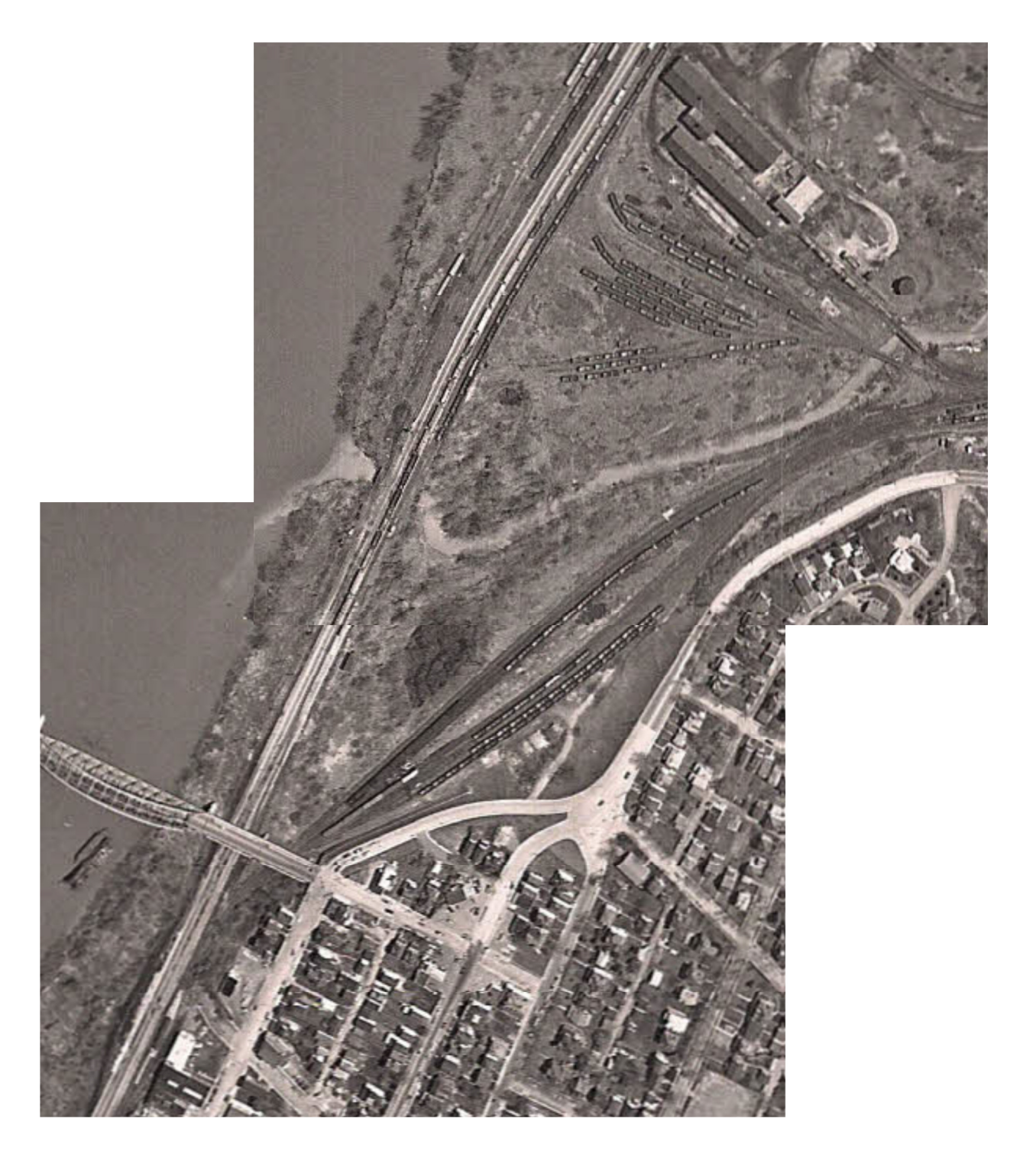
Gene - where are the 53 empties out of Mifflin going?

Greg - The 53 MTYs were picked up late on 4/17 by French. The crew was relieved at Brookside by Ceyrolles (COD 12:01). 43 MTYs were placed in No. 4 and 10 were placed on the Transfer.