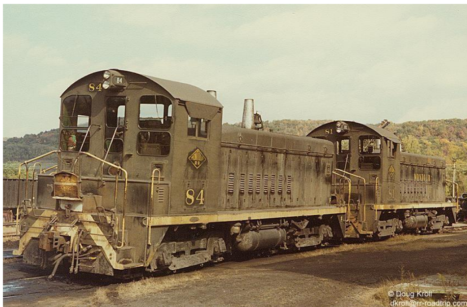
Diesel power came to the Montour in the early 1950's.

The Montour prospered during the 1930's and '40's, reaching its peak during World War II. In 1946, the Pittsburgh Coal Company merged with Consolidated Coal and sold the Montour Railroad operation to the Pennsylvania and the Pittsburgh and Lake Erie railroads as equal partners. Diesel power came to the Montour in 1950 and all steam locomotives were retired by 1953.