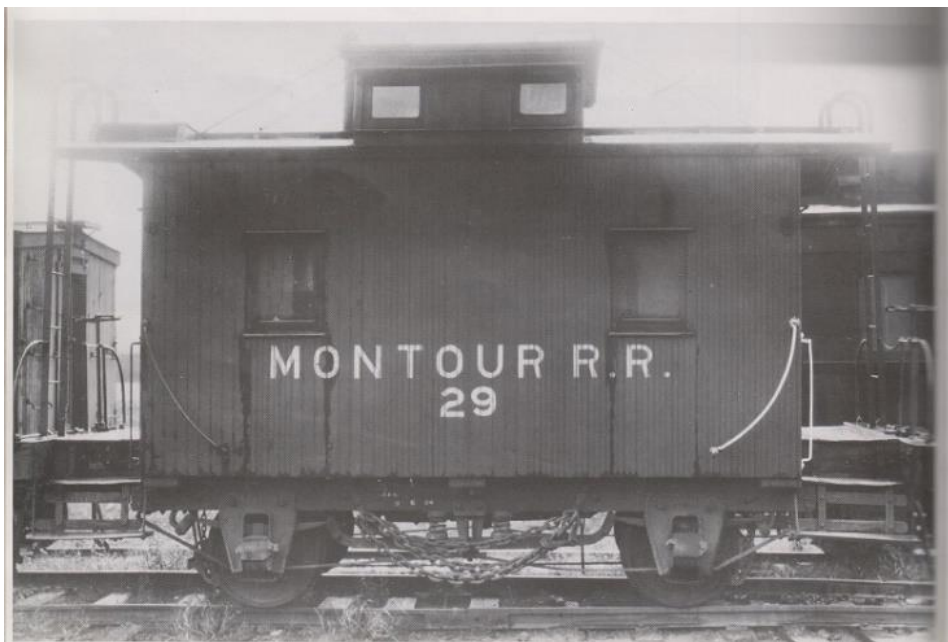
Caboose 29 was one of three wooden 4-wheel bobber type purchased from the New York Ontario & Western RR in 1921. It was retired in 1936.

Early Montour cabooses were made by converting wooden box cars, adding doors and perhaps a few windows or a cupola where a brakeman could keep an eye on the train cars in front of him, watching for problems or defects.