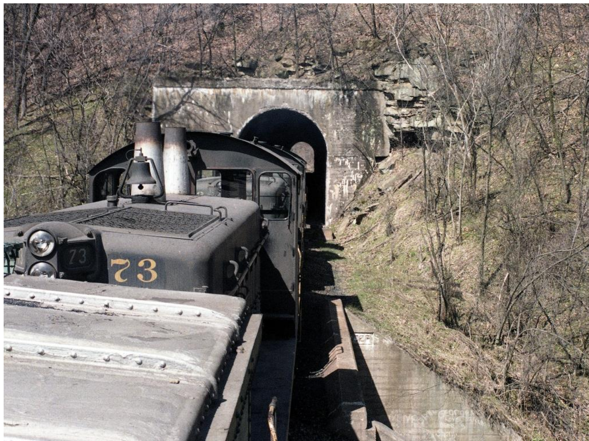
This view from a caboose cupola shows a set of eastbound Montour locomotives entering the tunnel in 1978.

The 575 foot tunnel eliminated a half-mile of track which followed Montour Run around the hill. This was the only tunnel on the Montour with a straight bore.