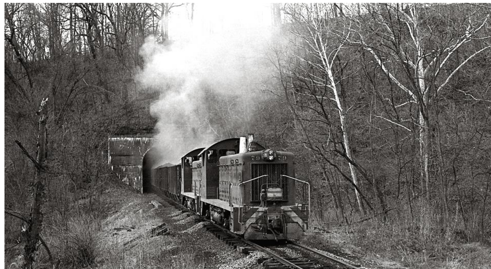
A westbound Montour coal train trails a cloud of exhaust smoke as it exits the tunnel and crosses the first of several bridges over Montour Run.